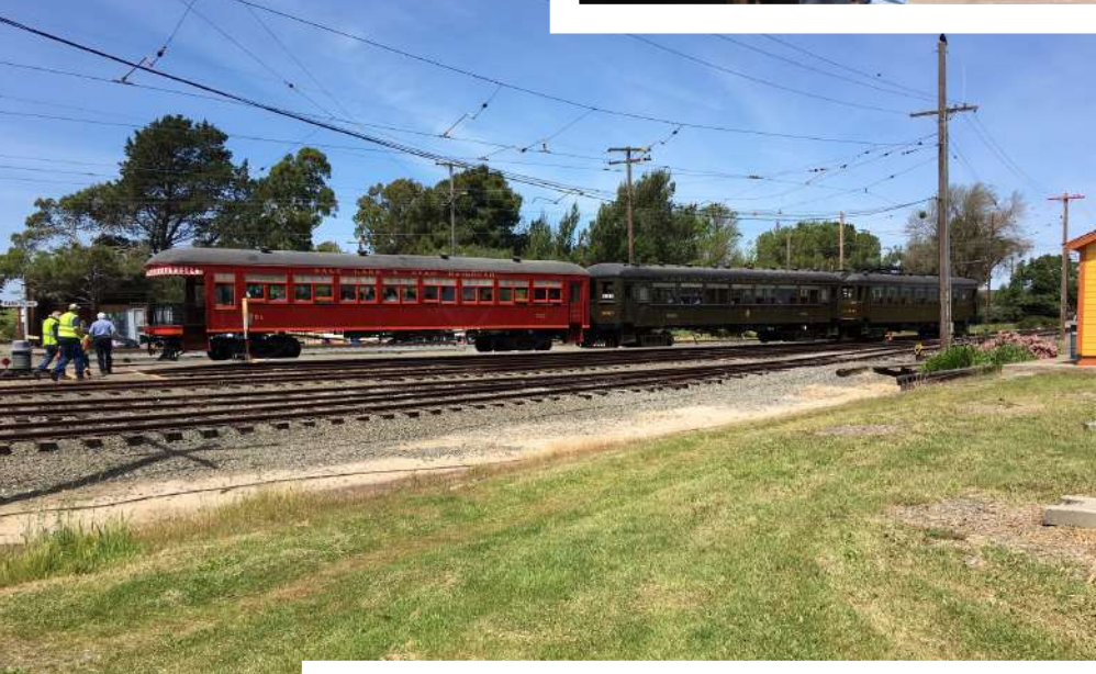
Excursion attendees board the museum trolley for a relaxing 15 mile ride during the lunch break.