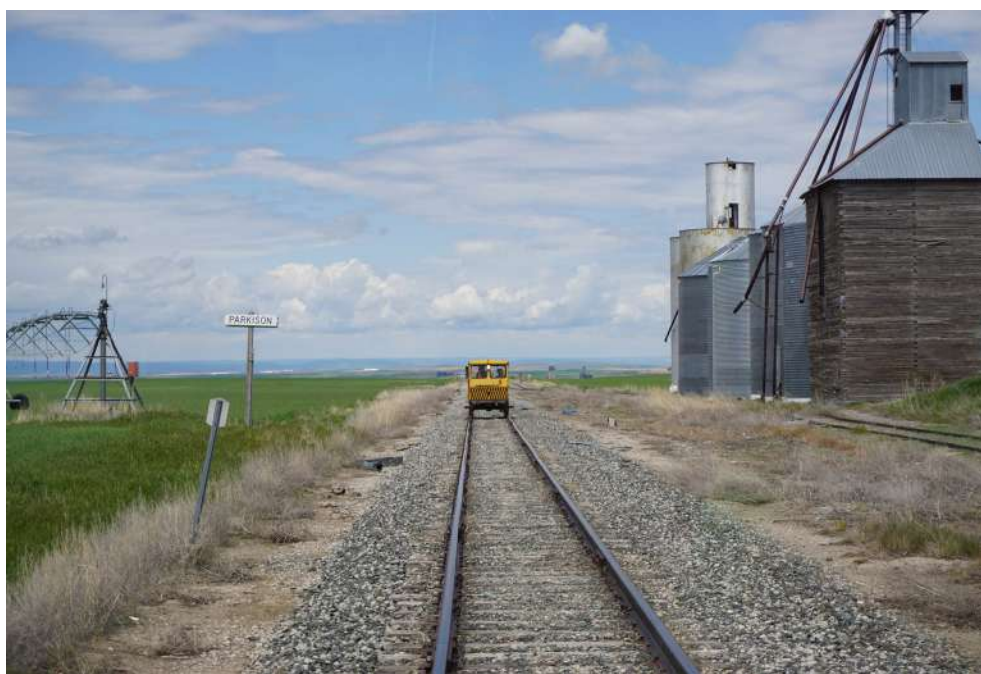
Passing a wooden silo in Parkison.

The railroad could not get the loco running so the run for Saturday was changed to the East Belt subdivision originally scheduled for Sunday while the railroad ran a locomotive from Twin Falls out to Rexberg to pick up the dead loco and finish switching the industries. Fortunately they got it all done and were back in the yard in Idaho Falls Saturday before we got back from a beautiful run to Newdale. The run was highlighted by perfect weather and cloudy skies keeping the sun exposure to a minimum.