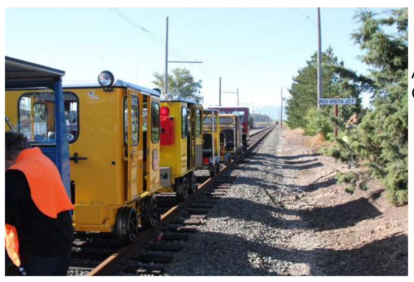
After lunch, the run to Cannon began.