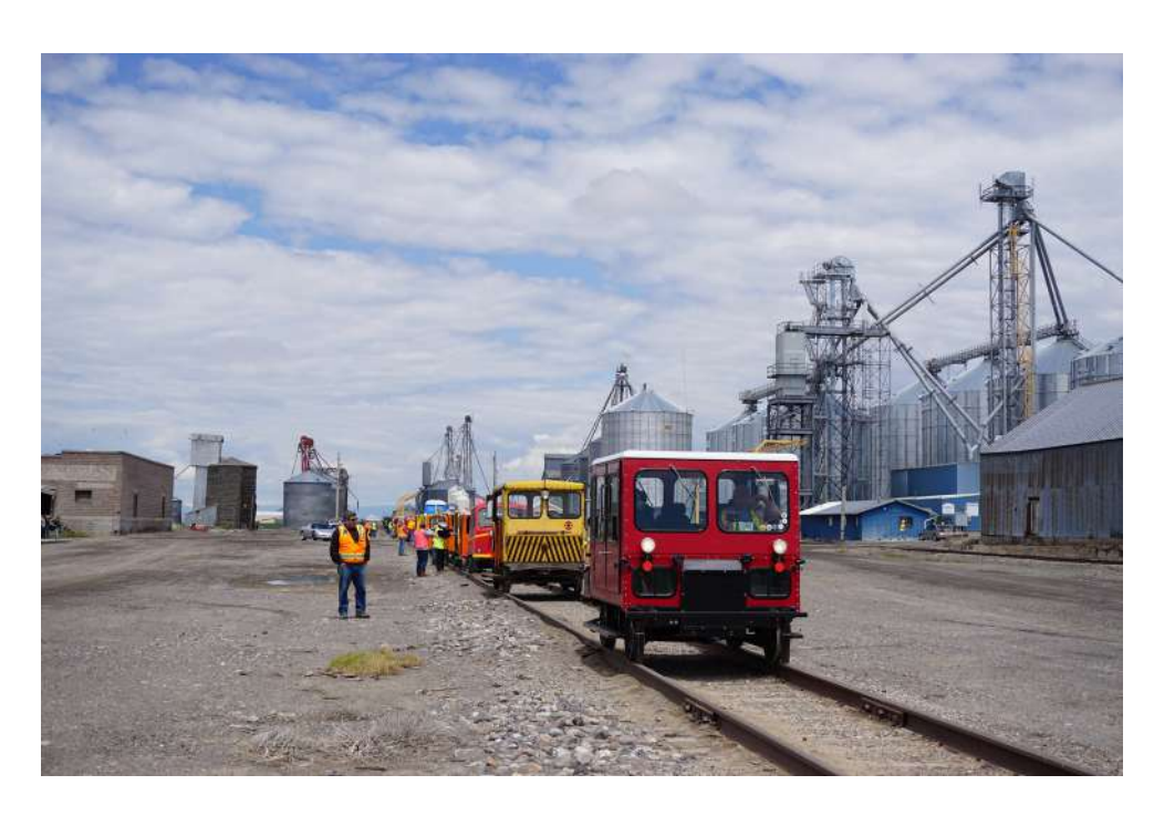
Turnaround in Newdale, ID.