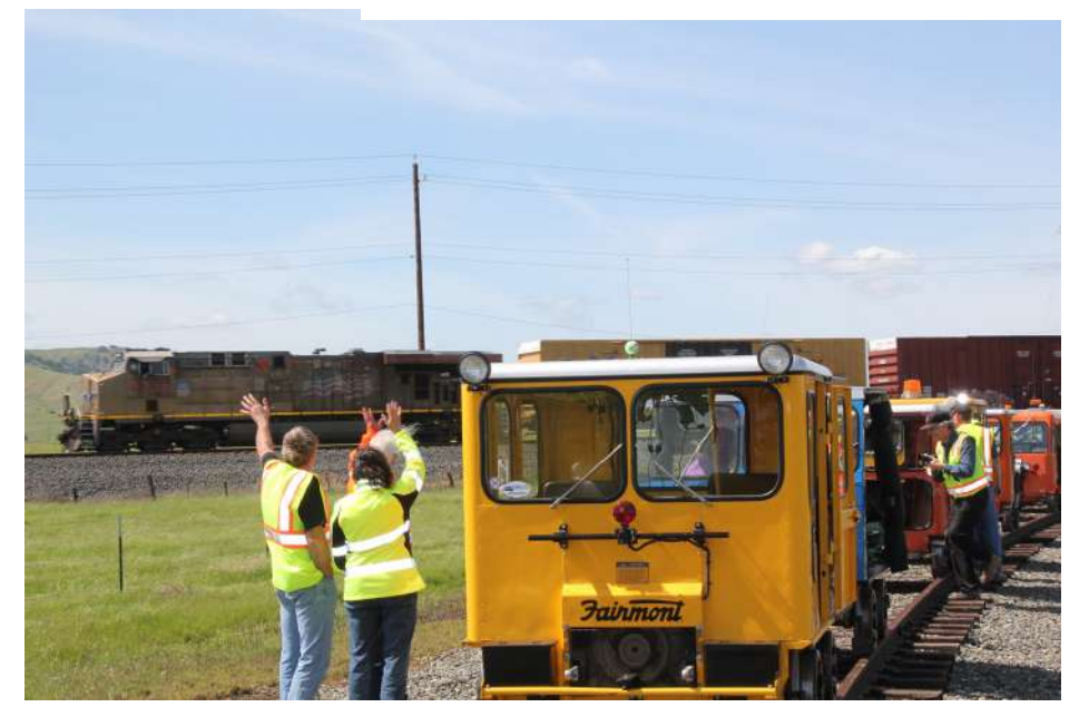
Waving at the passing BNSF freight at Cannon after turnaround.