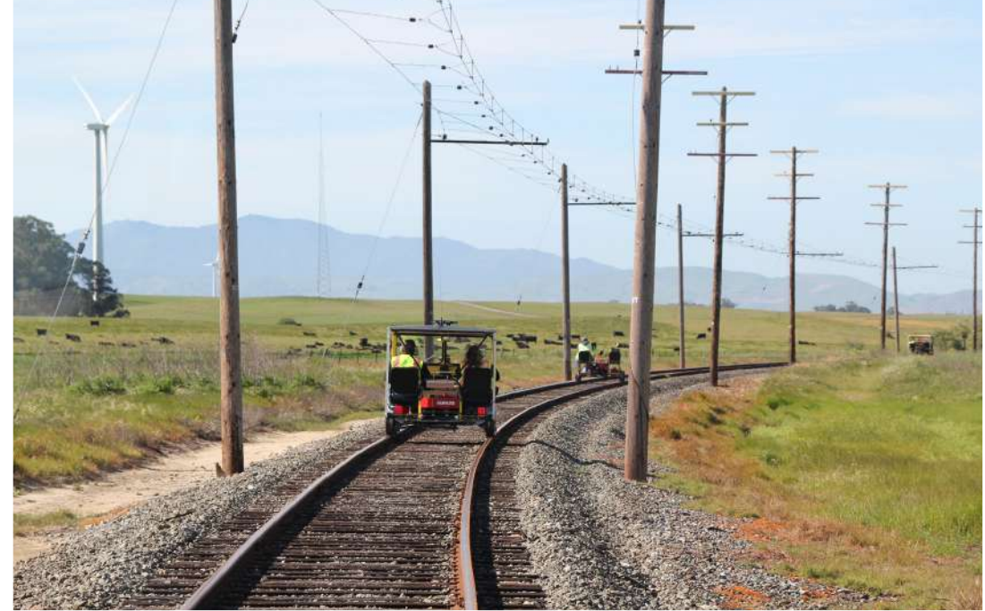
Enroute to Molena. Note the trolley wires overhead, we would be using those wires.

Leaving the WRM yard for Molena on the morning run.