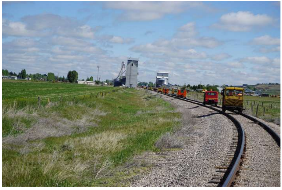
Approaching lona for a rest stop enroute to Newdale.

The railroad could not get the loco running so the run for Saturday was changed to the East Belt subdivision originally scheduled for Sunday while the railroad ran a locomotive from Twin Falls out to Rexberg to pick up the dead loco and finish switching the industries. Fortunately they got it all done and were back in the yard in Idaho Falls Saturday before we got back from a beautiful run to Newdale. The run was highlighted by perfect weather and cloudy skies keeping the sun exposure to a minimum.